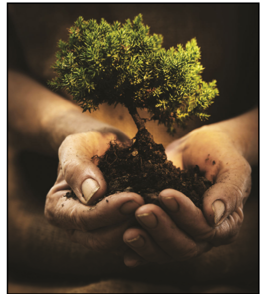
Lean Business Growth

The program is designed to give key leaders within your business the correct lean mindset, tools and experience to move forward on the journey toward operational and business excellence.